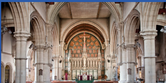
BOURNEMOUTH ORATORY IN FORMATION

Office email: cathedral@portsmouthdiocese.org.uk