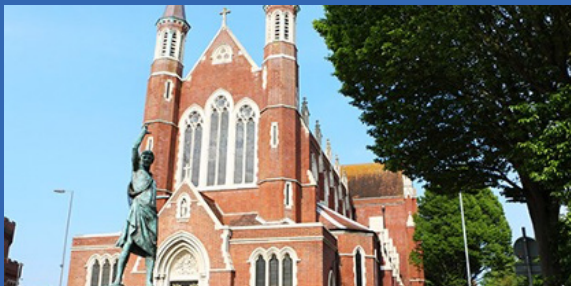
ST. JOHN'S CATHEDRAL PORTSMOUTH