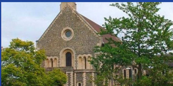
ST. JAMES READING

Office email: sacredheart@portsmouthdiocese.org.uk