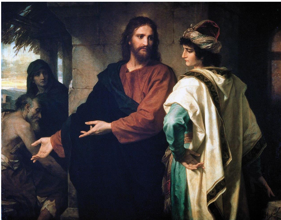
Christ and the Rich Young Man, Heinrich Hoffman, 1889

Hebrews 4:12-13 God's word is effective and is a source of true wisdom for us.