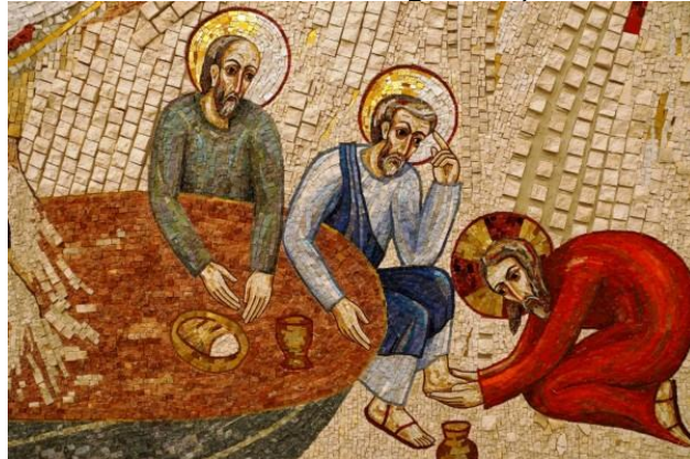
Jesus washing the Apostles' feet, Mosaic in the Redemptoris Mater Chapel, Vatican

Hebrews 4:14-16 We can approach Jesus with confidence because he knows our weaknesses and was like us in all things except sin.