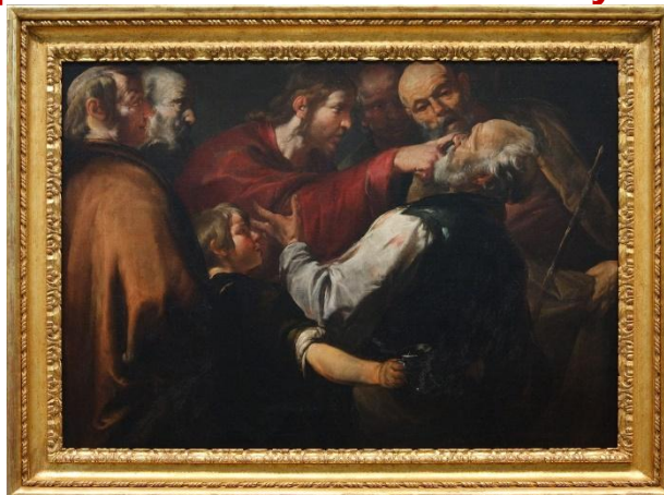
Christ Healing the Blind Man, Gioachino Assereto 1600–1649

Jeremiah 31:7-9 The prophet Jeremiah foretells the return of God's people from exile in Babylon. Even the most helpless will share in the joy of this great event.